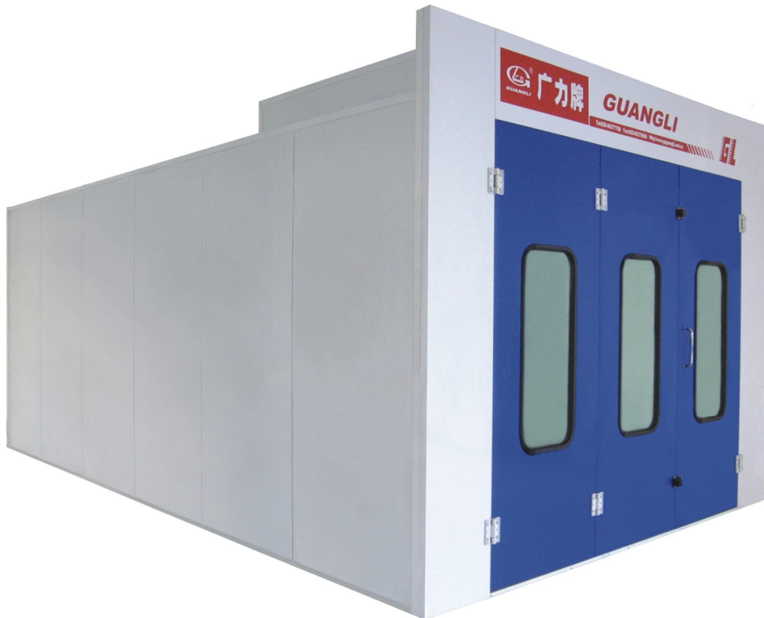
Guangli Spray booth Model: GL1